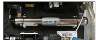
Fig 4. Ultraviolet filter