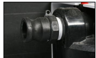
Fig 5. Inlet pipe