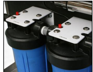
Fig 2. 30 and 5 micron filter housing