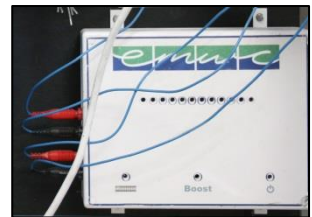
Fig 3. Electronic descaler