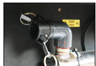
Fig 6. Outlet pipe