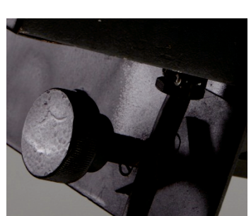
Fig.4 Adjuster knob