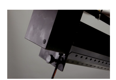
Fig.2 Packman motor