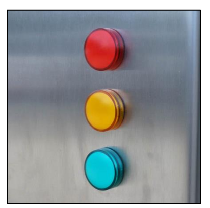
Fig 2. Control lights