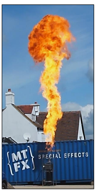
Fig 3. The effect