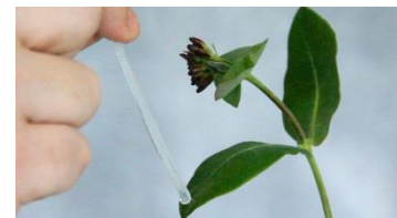
(fig.3) Dipstick being place on leaf