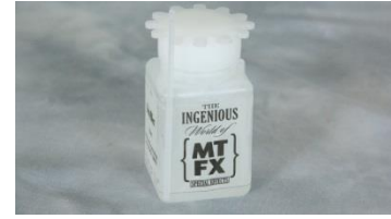
(fig.1) MTFX's Drop Effect