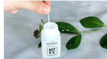
(fig.2) Dipstick into the drop solution