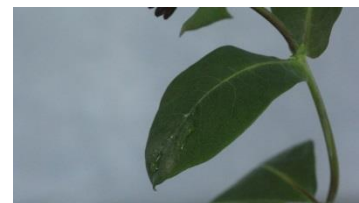
(fig. 4) Drop effect on a leaf