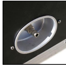
Fig 2. Gas inlet

Using the Flying Pic Maker MTFX can create your chosen logo and images in lighter-than-air bubbles which will float away over your event and disappear naturally without trace.