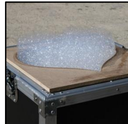
Fig 4. A shape being formed

Images will float up to around 150mtrs and will not cause issues with aircraft. The machines use a mix of oxygen and helium to create the images and the bubble fluid used is also non-hazardous to humans, animals and plant life.