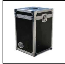
Fig 1. The Flying Pic Maker

The Flying Pic Maker creates floating bubble 'clouds' in a range of different shapes. Using a combination of specially formulated bubble solution and helium gas the MTFX Flying Pic Maker offers a unique and fun way of sending your logos and images out into the world.