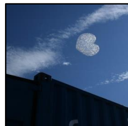
Fig 5. The effect

It can either be hired along with an MTFX Technician to operate it or permanently installed at your venue. Please contact us for prices and further info.