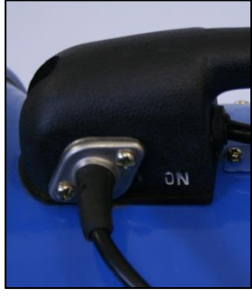
Fig 2. On/off switch