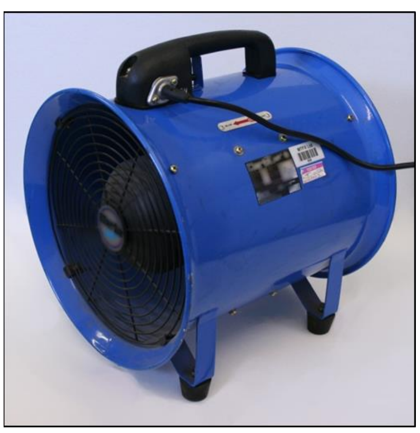
Fig 1. Inline Blower