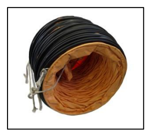
Fig 3. Optional hose