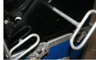
Fig 2. Horn Bar