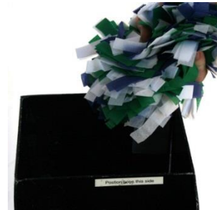
Fig 4. Loading Hopper