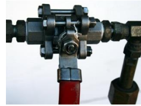
Fig 6. Valve Closed