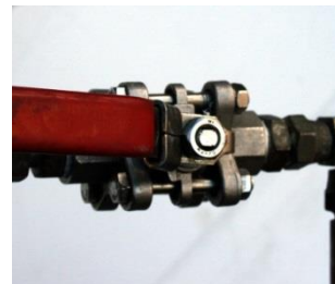
Fig 5. Valve Open