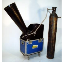
Fig 1. Master Blaster Setup