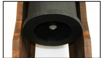
Fig 3. Cover removed showing CO2 hose hole