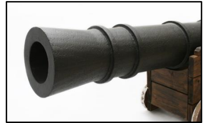
Fig 1. Front of cannon barrel

The Pirate Cannon is currently unavailable for dry-hire and can only be hired along with an MTFX Technician to operate it. Please contact us for prices and further info.