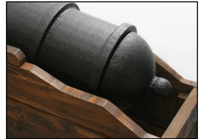
Fig 2. Back of cannon barrel