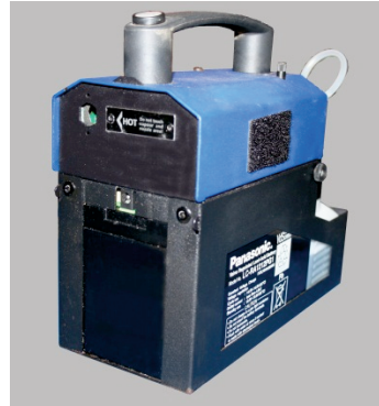
Fig.1 Power Tiny unit