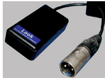
Fig.3 Radio remote