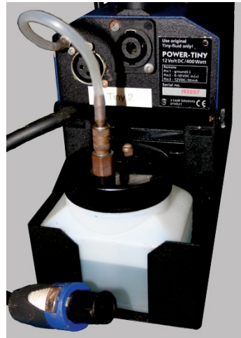
Fig.2 Fluid bottle