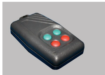
Fig.4 remote controller