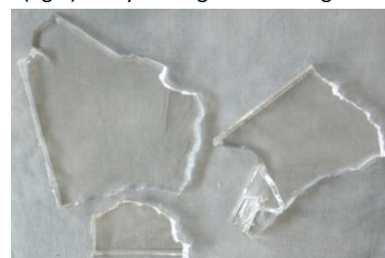
(fig.3) Broken shards of rubber glass.