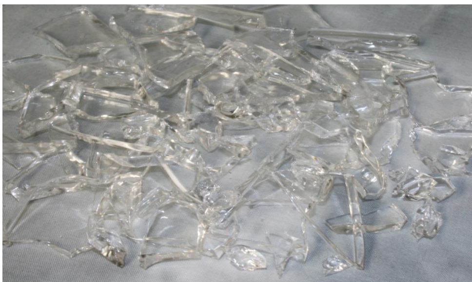
(fig. 5) Broken rubber glass placed together