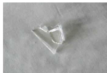
(fig. 4) Shard of rubber glass