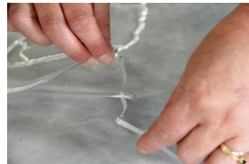
(fig.2) Easily tearing the rubber glass