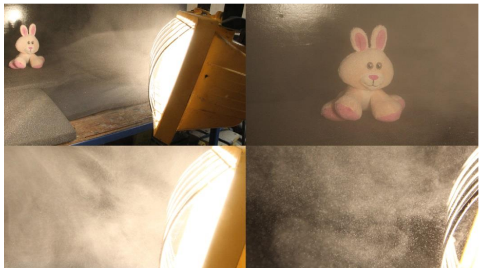
(fig. 5) Smoky Effect in action