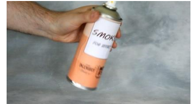
(fig.2) Shake Smoky effect before