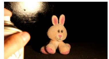
(fig. 3) Spraying Smoky Effect