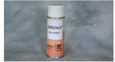
(fig.1) MTFX's Smoky Effect