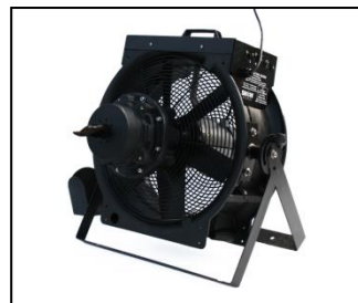
Fig 1. Snow Mini

Do not operate the Snow Mini in the rain. The unit is not waterproof. In the event of the unit getting wet immediately unplug the machine and cease use.