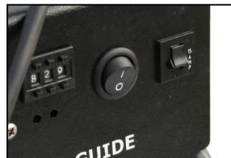
Fig 3. On/off switch