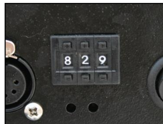
Fig 4. Control mode dial