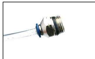
Fig 2. Fluid tube