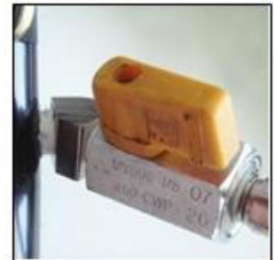
Fig 8. Filling lever in open position