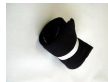
Secure the roll with tape, balloons, elastic bands etc