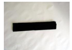
Fold in half again