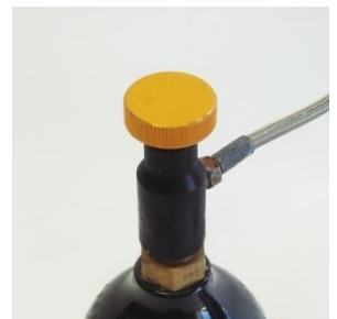
Fig 3. Gun bottle cap