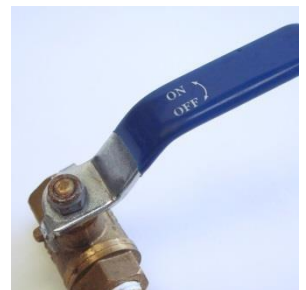
Fig 4. Bulk supply lever in 'off' position