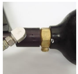
Fig 5. Bottle attached to gun