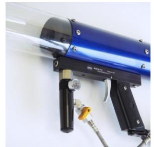
Fig 2. Close-up of T-Shirt Gun