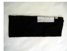
Fold in the arms