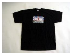
Lay your t-shirt down flat and smooth