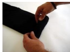
Starting at the neck, roll the t-shirt tightly