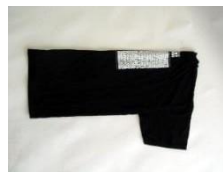
Fold in half and rotate 90°