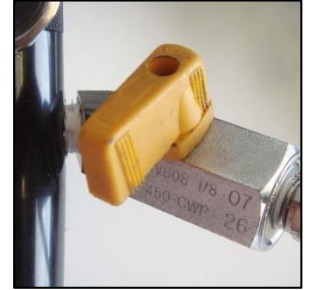
Fig 6. Filling lever in closed position