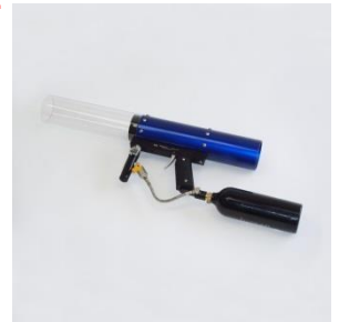
Fig 1. T-ShirtGun