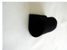
Test how well it fits in the shell; a snug fit works best