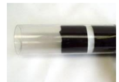
Load into the Gun shell