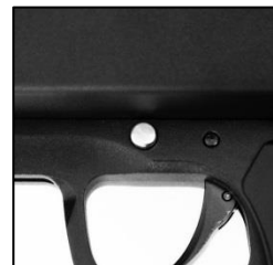
Fig 6. Safety button