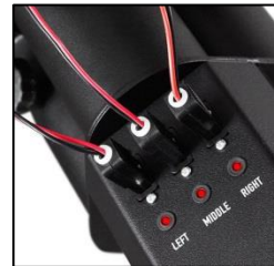
Fig 5. Cannons plugged in