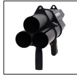
Fig 1. Front view

The Triple Shot Confetti Gun can be loaded with up to 3 disposable confetti (or streamer) cannons and fired either individually or as a simultaneous triple-shot. The confetti or streamers can reach distances of up to 20 metres.