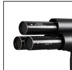
Fig 4. Loaded cannons