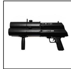
Fig 2. Side view