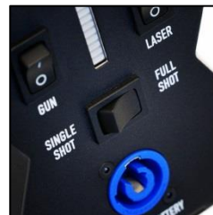
Fig 7. Single / full shot selector