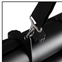
Fig 9. Shoulder strap