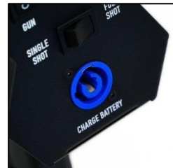
Fig 3. Charger socket