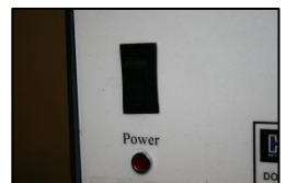
Fig 4. Power switch