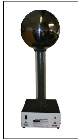
Fig 1. Van de Graaff Generator