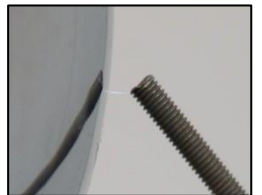
Fig 7. Discharging