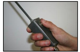
Fig 6. Control button