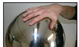
Fig 5. Users hand on dome