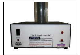
Fig 2. Control unit