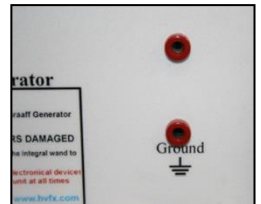
Fig 3. Earthing point