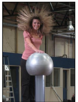
Fig 8. The effect