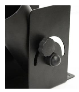
Fig 7. Angle thumbscrew