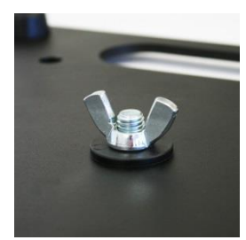
Fig 5. Base wingnut