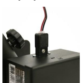
Fig 8. Tube Plug Connector