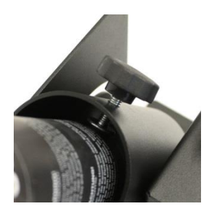
Fig 6. Tube thumbscrew

We recommend purchasing additional confetti tubes for testing purposes if timing is critical.