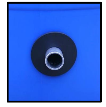
Fig 4. Machine snow outlet