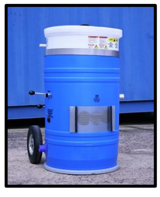
Fig 1. Snow Flock Machine