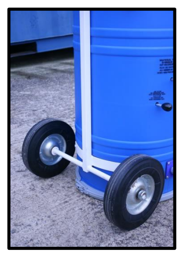
Fig 7. Transportation Wheels