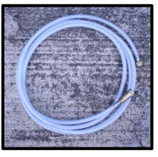
Fig 9.Quick Fit Water Hose