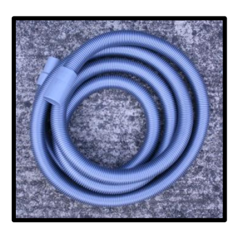
Fig 10. Snow Material Hose