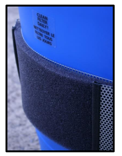
Fig 6. Filter