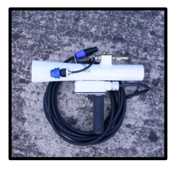
Fig 8. Flocking Nozzle