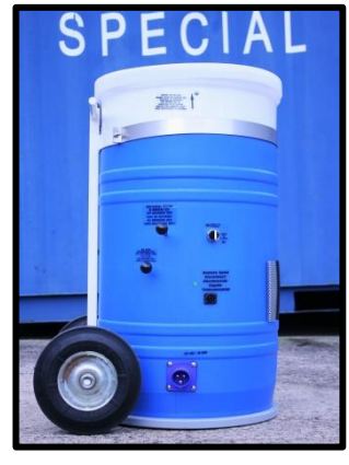
Fig 2. Flocking Machine Controls